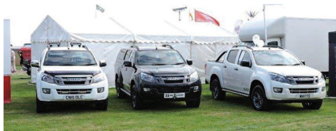
Vale of Glamorgan Show Fonmon Castle. A lovely sunny day at the Vale of Glamorgan Show which was complimented by a large number of visitors to our Isuzu stand.

"Congratulations to the Service Teams at Swansea & Newport, who have once again achieved a 100% MOT first time pass rate. It's very impressive to receive top marks in this important discipline."