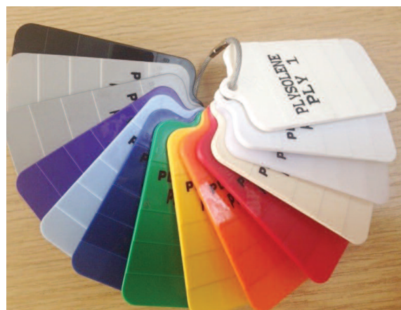
Plysolene's new standard colour range