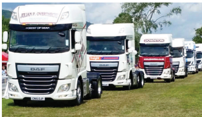
DAF continues to dominate the market

After another 1000+ new truck registrations in July, DAF's year-to-date dominance of the Euro 6 market climbed to 27.4% market share. The dominance is attributed to three main factors – they are the most reliable range of trucks with the lowest operating costs, backed up by the industry's most comprehensive network and are built in Britain. More than 6,200 DAF Trucks have been delivered so far in 2015.