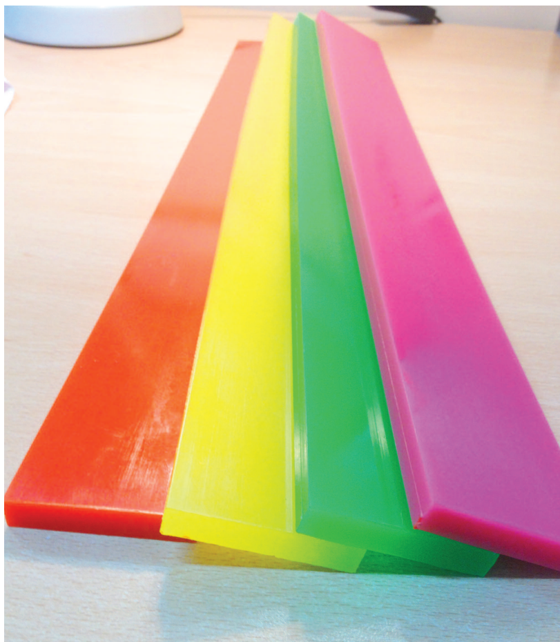
Urethane continue to innovative to stay ahead of the competition

Once developed, it will be promoted and sold through the existing distributor network.