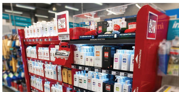
Plysolene's latest work on display at Halfords