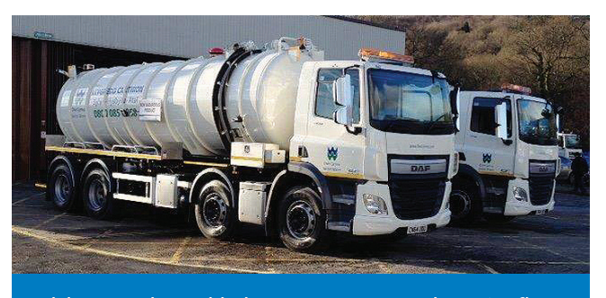
Welsh Water has added two new DAF trucks to its fleet

Welsh Water has chosen WTV to supply two new Euro 6 DAF trucks, adding to its fleet of vehicles. Both vehicles were to a high specification including AS-Tronic gearbox and ZF-Intarder breaking system.